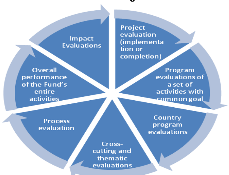
Figure 3: Types of evaluation in international organizations

31. It is common practice in international organizations that evaluation policies and programs include different types of evaluations, as depicted in the diagram below. The Board will need to determine how these different types of evaluation can be combined to support the accountability, oversight and learning needs of the Fund.